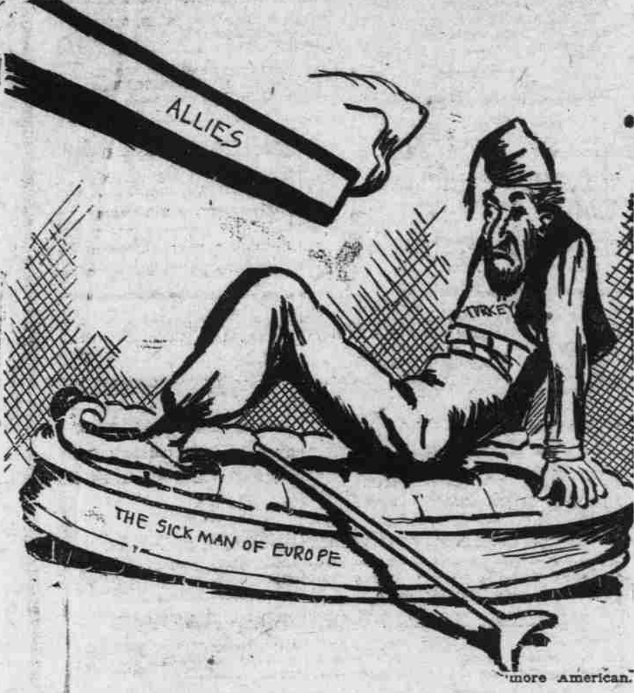
PICK UP YOUR BED AND WALK