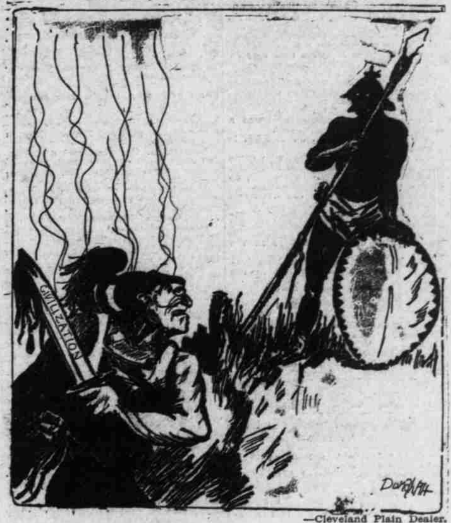
Cleveland Plain Dealer