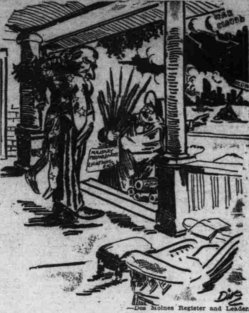
Des Moines Register and Leader