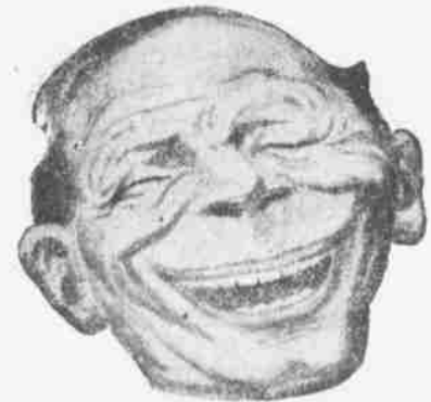
Kellogg's Sanitone Wafers Make You Feel Fine All the Time.

This is the world's newest, safest, most reliable and effective nerve invigorator, revitalizer, brain awakener, body strengthener, without equal in the world's history of medicine. It brings about a change from that awful dull, weak, lazy, don't-give-a-hang feeling to brightness, strength, clear-headedness and courage which is remarkable.