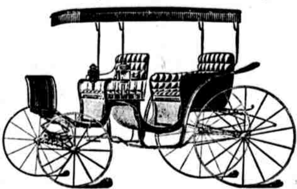
of a new line of UP-TO-DATE

...FAMILY SURRIES... Stylish, roomy and comfortable. Standard Goods. - None Better.