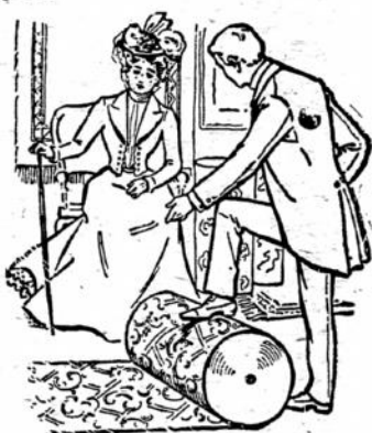
F. L. LUDDEN.

We guarantee city prices on all our carpets.