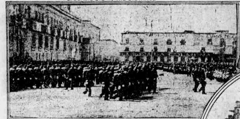
INFANTRY MASSED IN FRONT OF NATIONAL PALACE