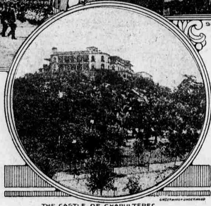
THE CASTLE OF CHAPULTEPEC