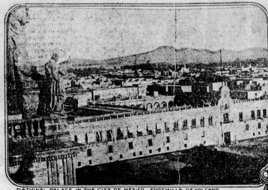
NATIONAL PALACE IN THE CITY OF MEXICO, FOOTHILLS OF VOLCANO POPocatepetl IN THE DISTANCE

Scenes on the streets and around the City of Mexico, from photographs taken as troops were being hurried into National Capital to strengthen Huerta during recent presidential campaign.