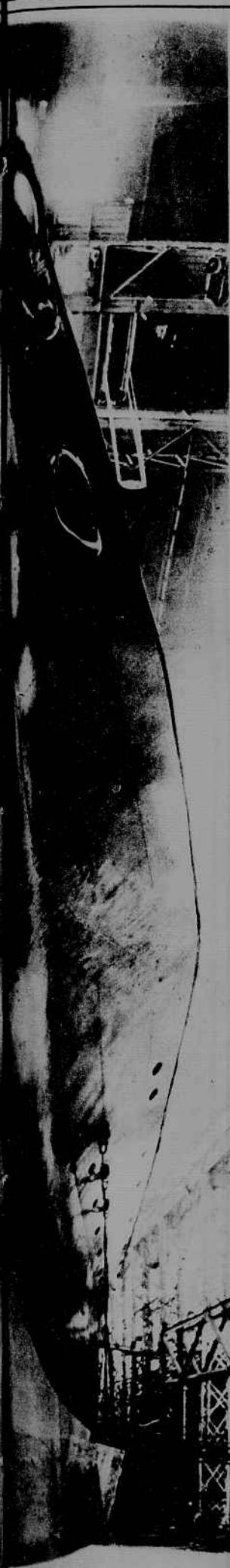
of the U. S. S. North Carolina, the anden, N. J. The weird "figure- angle and is formed by the holes photo gives one a good idea of the new battleship.