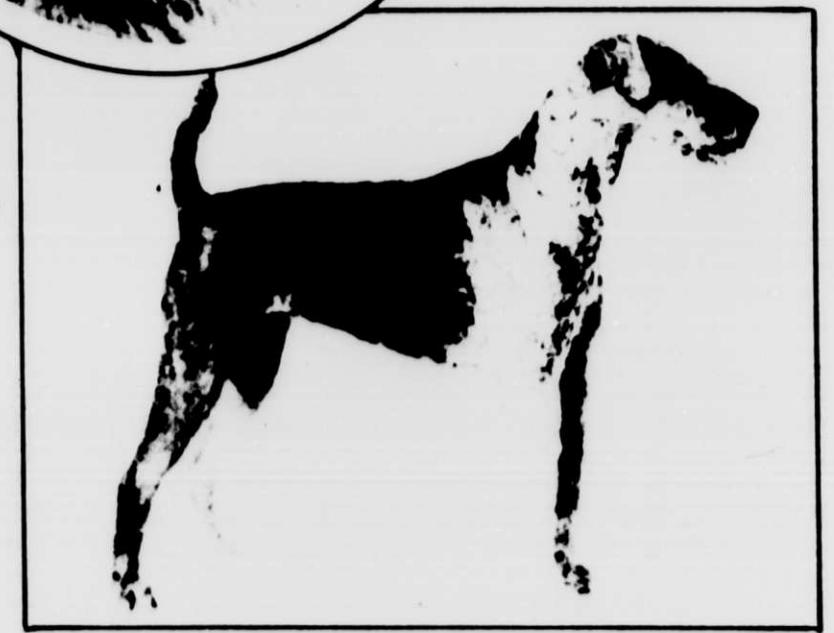
"Heathcote Enchantress," Airedale terrier, owned by Heathcote Kennels, White Plains, N. Y.