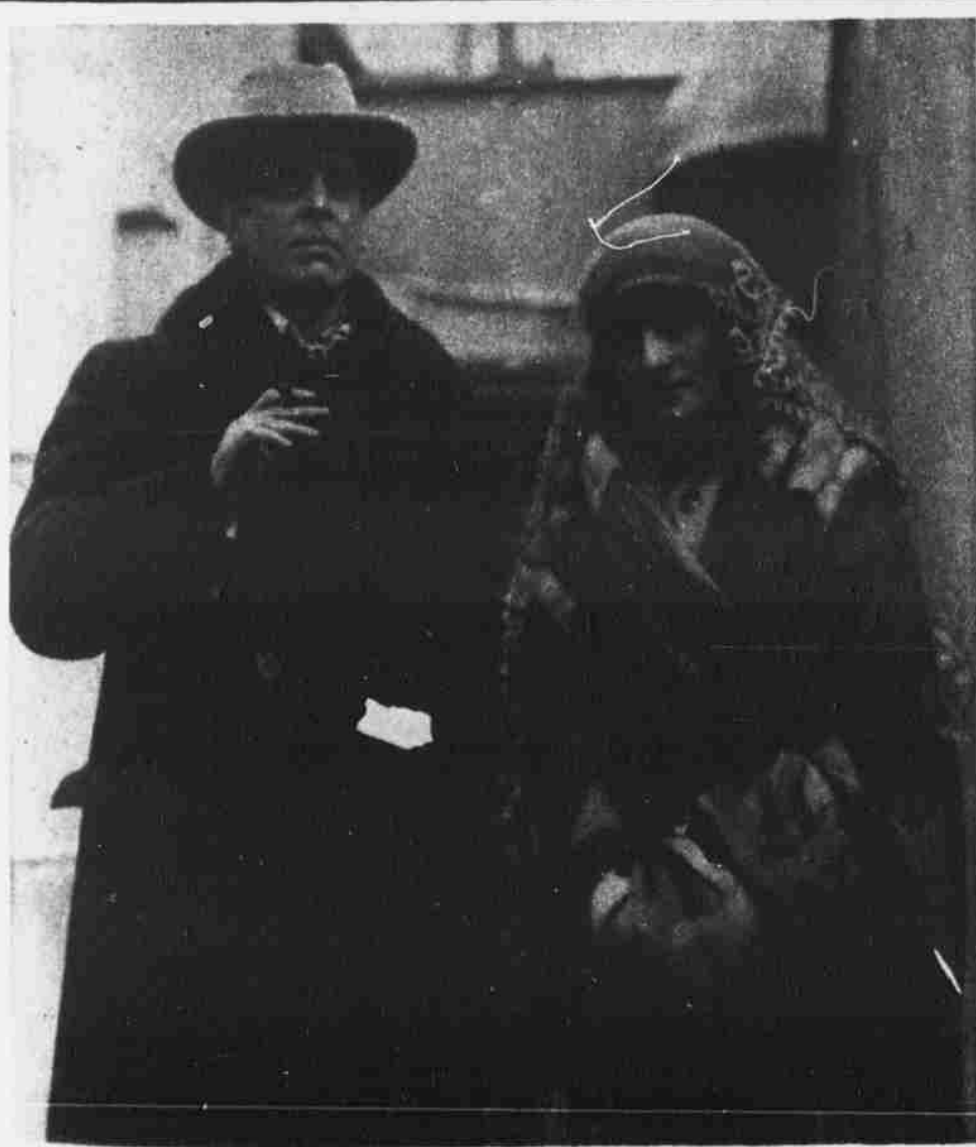
At left—W. B. Yeats and his wife, recent arrivals in America. The famous poet is here for a three months lecture tour.