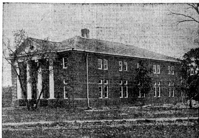
THE NEW BUILDING IN WHICH THE DINING HALL IS LOCATED. The Upper Story is Used for Office Purposes and as Storerooms.

THE BRADFIELD REGULATOR CO., Atlanta, Ga.