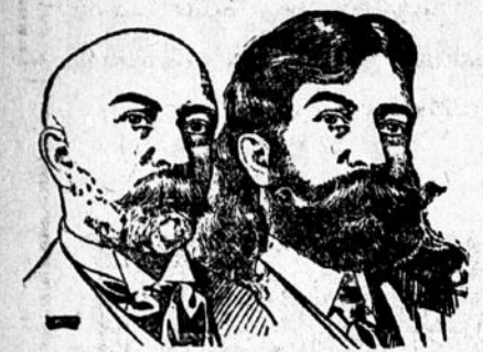
Discoverer of This Magic Compound That Grows Hair in a Single Night.

Famous Doctor-Chemist Has Discovered a Secret Compound That Grows Hair on Any Bald Head.