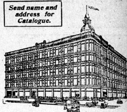
Dollars Saved at Donaldson's.