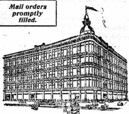
Desirable Goods at Donaldson's.

Primroses, regular 50c. Sale price..... 25c Dutch Hyacinths, regular 25c. Sale price..... 18c Palms, low plants for table decoration, reg. 50c. Sale price..... 25c Our famous long-stemmed single Violets, regular 75c and 50c bunches. 38c Sale price, one day only..... Roses, pink, white and red, regular, per dozen, $1.50. Sale price for one day only..... 75c