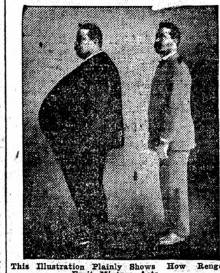
This Illustration Plainly Shows How Rengo Fruit Mixture Acts.

Rengo Fruit Mixture is Nature's own way of curing obesity, and it does it in that perfectly harmless way in which Nature does all things. It reduces the weight to a normal point, builds up the general physical condition, replaces the