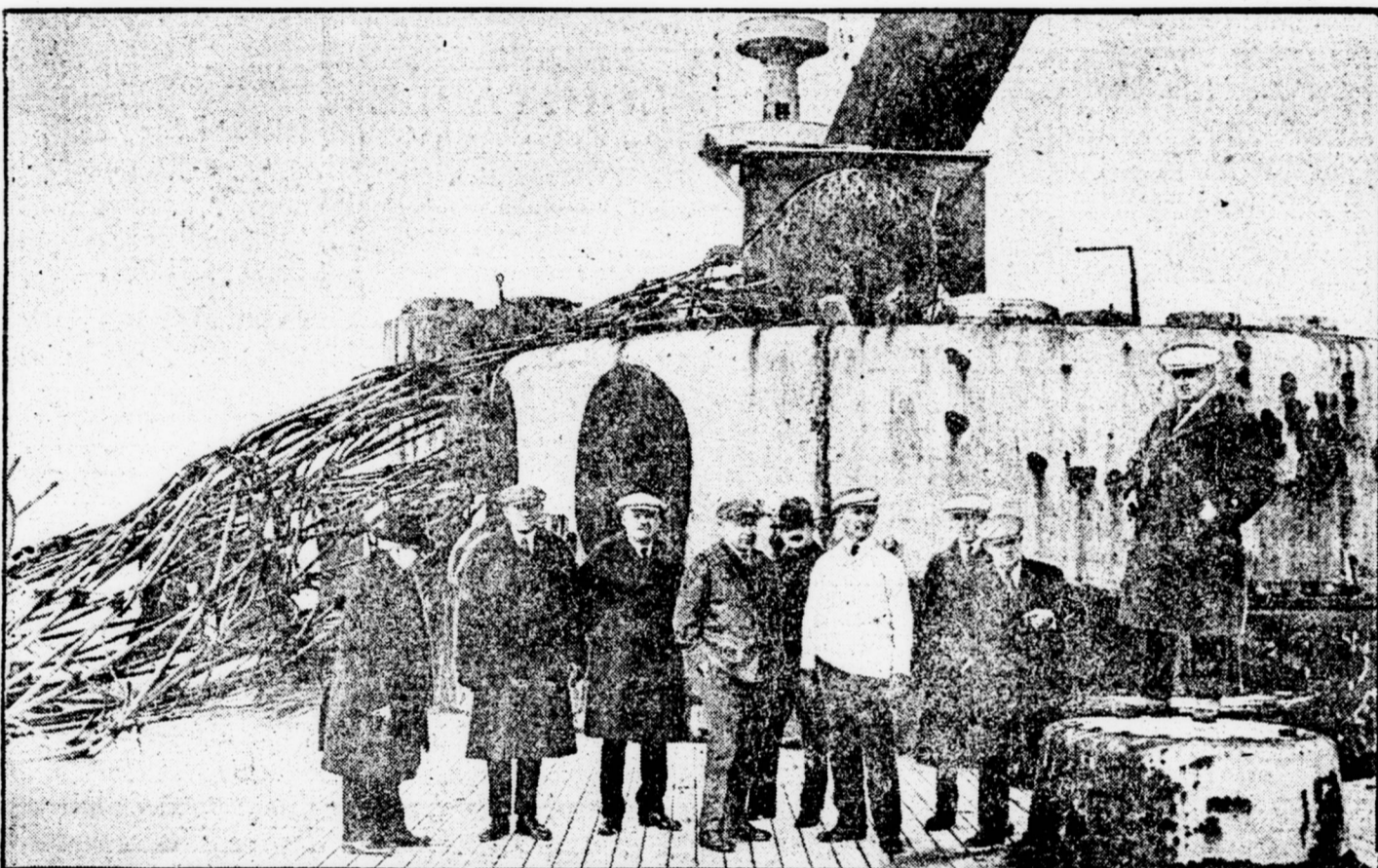
OLD BATTLESHIP OF "FIGHTING BOB" EVANS IS SOLD AT AUCTION. Hulk of the historic U. S. S. Indiana, used as a target for the Navy gunners and bombers, being sold at public auction as scrap. The photograph shows naval officers and steel and wrecking experts inspecting the hulk. Admiral Evans once used the vessel as his flagship.