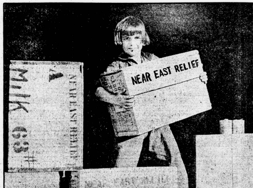
JACKIE IS HELPING THE NEAR EAST RELIEF. The young star of the movies is helping handle the first condensed milk collected on the Pacific coast in response to the recent country-wide appeal of Henry Morgenthau and other Near East Relief workers.