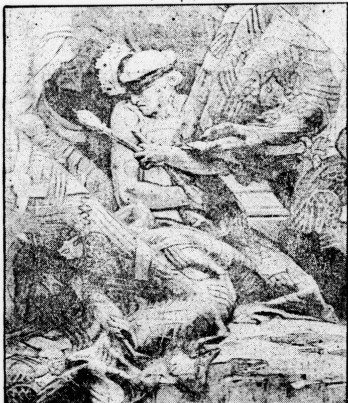
VANDALS SPRAY INK ON FAMOUS PAINTING. John Singer Sargent's famous mural painting, "The Synagogue," in the Boston Public Library, which was seriously damaged recently by vandals. Ink was thrown over the canvas, and experts are trying to remove the spots.