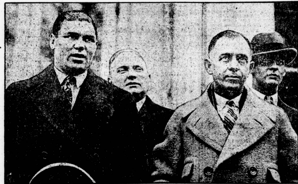
HEAVYWEIGHT CHAMPION VISITS THE WHITE HOUSE. Jack Dempsey and his manager, Jack Kearns, who called on President Coolidge yesterday. The champion also visited the national cathedral and placed a wreath at the crypt of former President Woodrow Wilson.