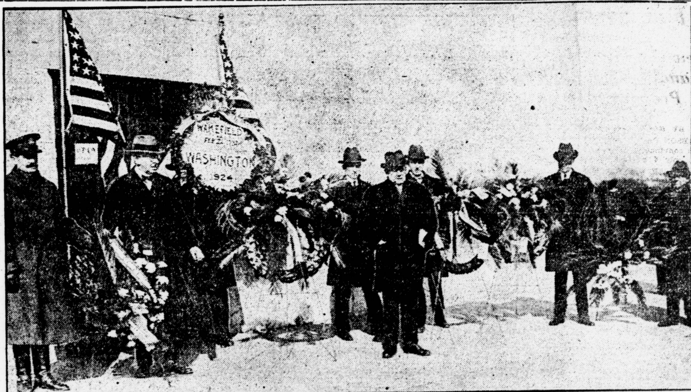
WASHINGTON'S BIRTHDAY CEREMONIES AT THE MONUMENT. The National League of Masonic Clubs held special services at the base of the Monument yesterday. Speeches were delivered and a wreath placed in memory of the first President of the United States.