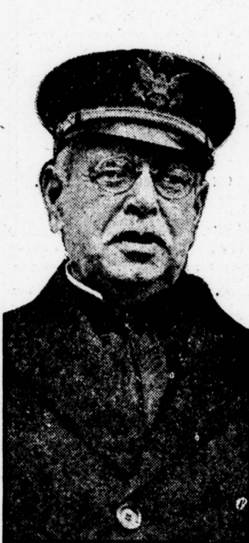
John Philip Sousa, who called on President Coolidge at the White House yesterday afternoon. Mr. Sousa once was the leader of the famous Marine Band, in Washington.