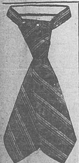
The Latest Hot Weather Scarf For Only 25c.

400 Elegant Patterns of this New Style Hot Weather Scarf. Extra well made from the very finest silks. Regular 50 cent Scarf for only 25c. Call and see this bargain.