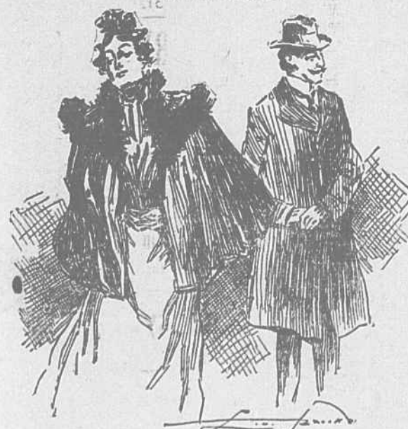
Mr. Deafly—There is the man that made your shirts. Mrs. Deafly—Major Shirts, where?