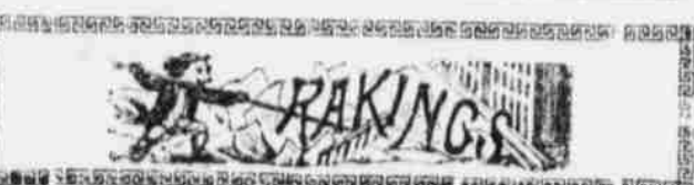
HE DIDN'T KNOW.

With the Panama Canal lying to the south of the land with which we have to deal makes the problem of additional seriousness.—Portsmouth Times.