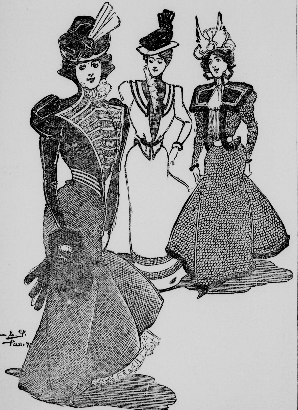
"It is at this season that one gets the best glimpse of the 'grand dames'"

covered close with a running pattern in black soutache braid, were inserted, with smaller revers of braided velvet