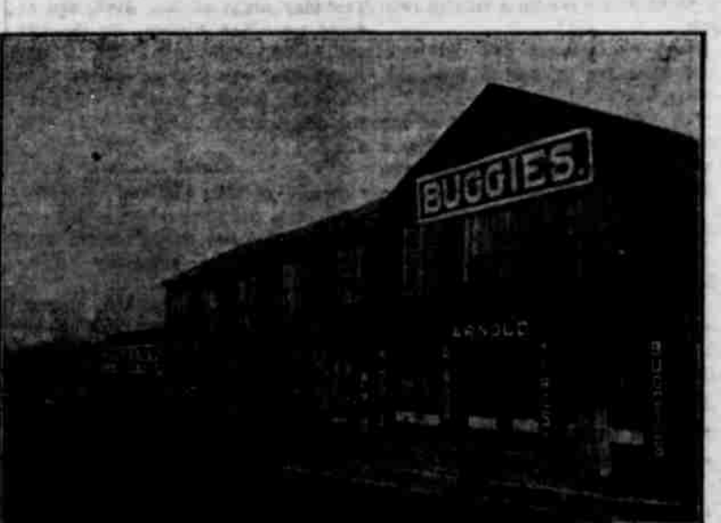
Arnold Factory, Second Street, Danville, Ky.

Repairing and Rubber Tiring are our Specialties