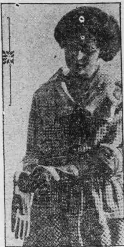
Wear gloves while you are working

Last week I quoted a world famous palmist on the various types of hands and what they signify. But no palmist has ever talked about the type of hand I think the most interesting of all—the hand where the tragedy of poverty and hard work is written in every line and wrinkle, in every enlarged knuckle and on the hardened yellow palm. The overworked hand is the most tragic sight I know. All traces of youth and loveliness have disappeared, all characteristics submerged and nothing is left by a record of sacrifice and struggle.