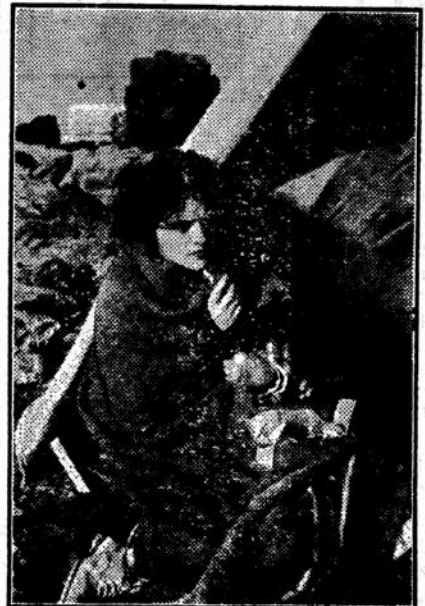
A Jesse L. Lasky production with Edith Tallaferro in a bit of human comedy tonight. The theme of the comedy is rich and it has yielded no common crop of laughs.

No more temptation to cuss that old, dried-up mucilage pot--nor that mouldy paste! The B & S Refillable Mucilage Applier is always ready--always fresh--always clean--pneumatic feed--self closing.