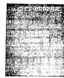
COLUMNAR BLANK BOOKS

Single and Double Entry and Loose Leaf. All sizes and all prices.