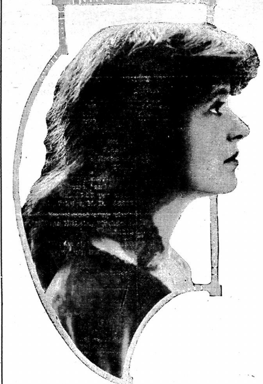
MARGUERITE CLARK. FAMOUS PLAYERS-PARAMOUNT STAR

The winsome little star of the Famous Players Film Company, Marguerite Clark, who within a phenomenally short time has sprung into international fame as a film favorite, is a revelation in her latest screen appearance in the Famous Players five-part production of Frances Hodgson Burnett's picturesque romance of old Spain, "The Pretty Sister of Jose," which is the chief attraction on the Paramount Program at the Grand theater tonight.