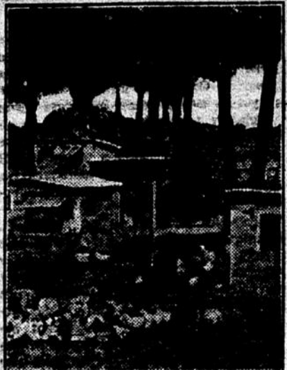
Shade and Clean Coops Furnished Young Chicks on Government Farm at Beltsville, Md.

(Prepared by the United States Department of Agriculture.) Produce infertile eggs. They are worth more, as they keep better and they cost less to produce since there are no roosters to feed. No expense, education, ability, or labor other than catching and killing or selling the roosters are necessary. Remove the males at once. While eggs are plentiful some should be preserved for the winter months, as they will be scarce and high priced. It costs but little in time, money and labor, and is so easily done that it is only common sense to do it. Use fresh, infertile eggs and let customers know that they can get such eggs as preserving. Those who have never preserved eggs should get in touch with the county or home demonstration agent, the state extension director, or the United States department of agriculture. Now is the time to begin culling flocks. Send the roosters to the shipping block or the market. Eliminate all weaklings and deformed chicks. Get rid of the chick that stands alone, the side of the coop with its wings down, its feathers ruffled, eye shut, and head down. Do not keep a single chick that you are not sure it will pay to raise. Shade, clean fresh water, clean coops, and clean houses and good ventilation and plenty of room during