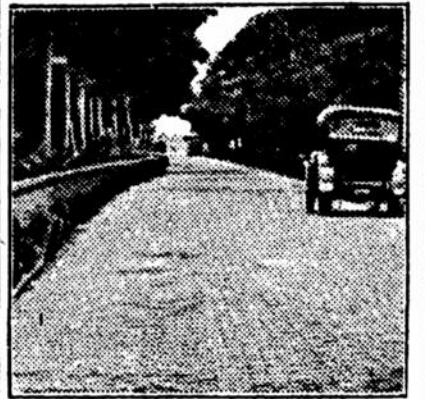
A Brick Road in Pennsylvania.

There are places in Pennsylvania where it costs more to haul farm products to a railroad station than it does to pay the freight to France. As in the past, the hope of the future from a moral point of view, is to maintain a happy, contented and prosperous people on the farms and in the small towns and villages. They don't produce I. W. W.'s, ballot-box stuffers, election fraud crooks, gun-