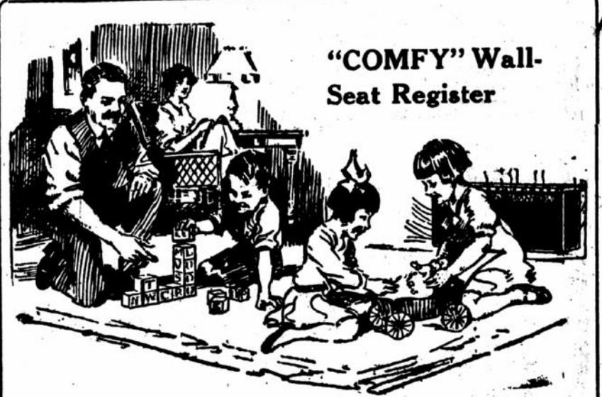
"COMFY" Wall-Seat Register