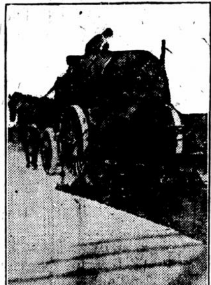
Surface treatment of Macadam Road With Bituminous Material and Stone Chips.

In addition to $10,000,000 for forest road construction, congress has made available to July 1, 1920, the sum of $275,000,000 for federal aid roads. Of this sum $175,000,000 was available up to and including June 30, 1920. Of this amount the states had made application covering $152,193,040 as of April 30. This federal aid is to apply