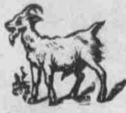
BE A BOOSTER.

If you see some fellow tryin', For to make some project go, You can boost it up a trifle; That's your cue to let him know That you're not a-going to knock it, Just because it ain't your "shout," But you're goin' to boost a little, 'Cause he's got "the best thing out."