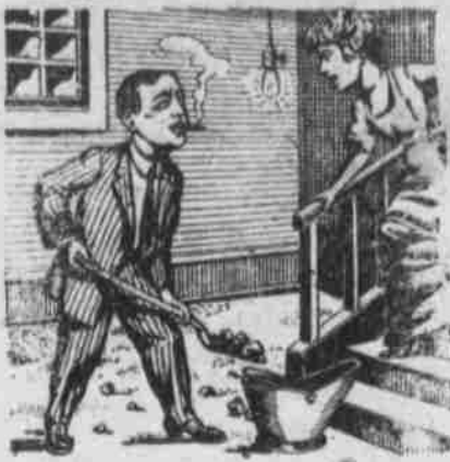
"YOU'RE A NICE MAN"

Helpless—a man without a collar button and a woman without a hairpin.