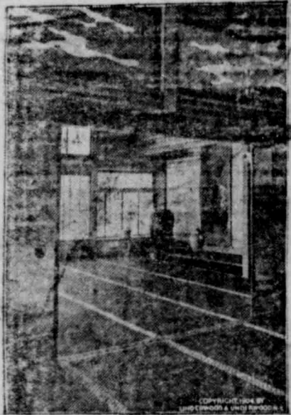
JAPANESE SECTION OF OKUMA'S HOME.

fish and beautify the position they had won by force of arms. He declared that his countrymen were a peaceful rather than an aggressive race, that the Chinese were absolutely ungrateful and that there was no such thing as a real "yellow peril."