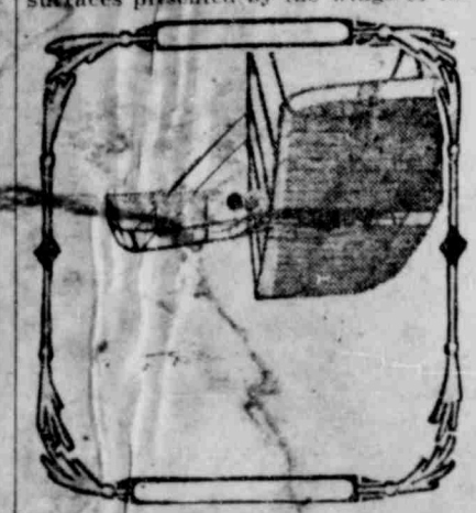
THE WRIGHT AEROPLANE IN FLIGHT.

The Wright machine is a gliding machine. There is no dependence on balloons in any form. The craft is built to operate on the heavier than air principle and to overcome the law of gravitation by the resistance to the air caused by rapid flight and the broad surfaces presented by the wings of the