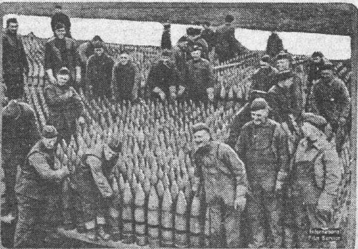
A huge pile of German 17 centimeter naval shells at the munitions depot at Mulheim, Germany. They are to be shipped to America to decorate parks and libraries. These shells are considered the best of all Germany could produce.