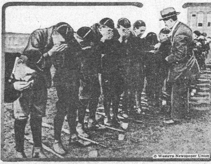
Owing to the flu epidemic in England, the Litchfield authorities have closed the schools. The headmaster of the King Edward VI grammar school got permission to carry on his school with out-of-door games, parades, drills, etc., to fight the flu. One of the methods taken was to have the boys inhale disinfectant through their nostrils after each exercise was completed.