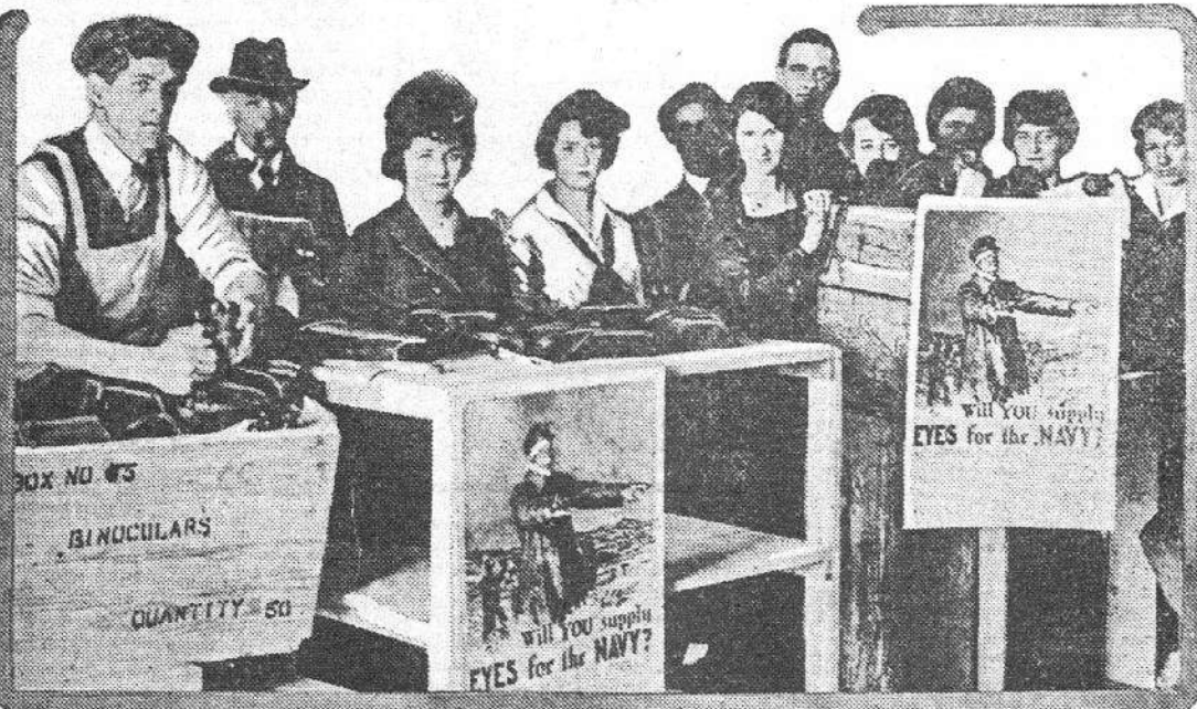
When the navy department called for more "eyes" for the navy, 52,000 patriots responded by lending their field glasses, 32,000 of which were accepted. This photograph shows war workers packing the field glasses in cartons and returning them to the owners. The glasses proved to be of great value to submarine chasers and destroyers during the war.