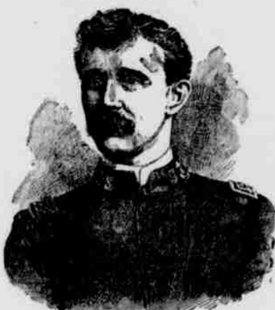
The Salvation Army