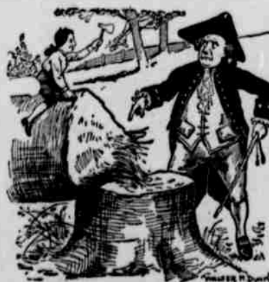
George With His Little Hatchet

may have cut down his father's cherry tree, but if his hatchet had been bought from our superior stock he probably would have hewn down the whole orchard in the same length of time. Our stock of fine steel hatchets, axes, saws and tools of all kinds are of the best manufacture and material to be procured.