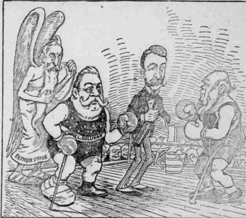
It is rumored that John L. Sullivan and Charlie Mitchell are matched for a twenty round mill, with Dr. Osler and Father Time as officials. —Minneapolis Journal.