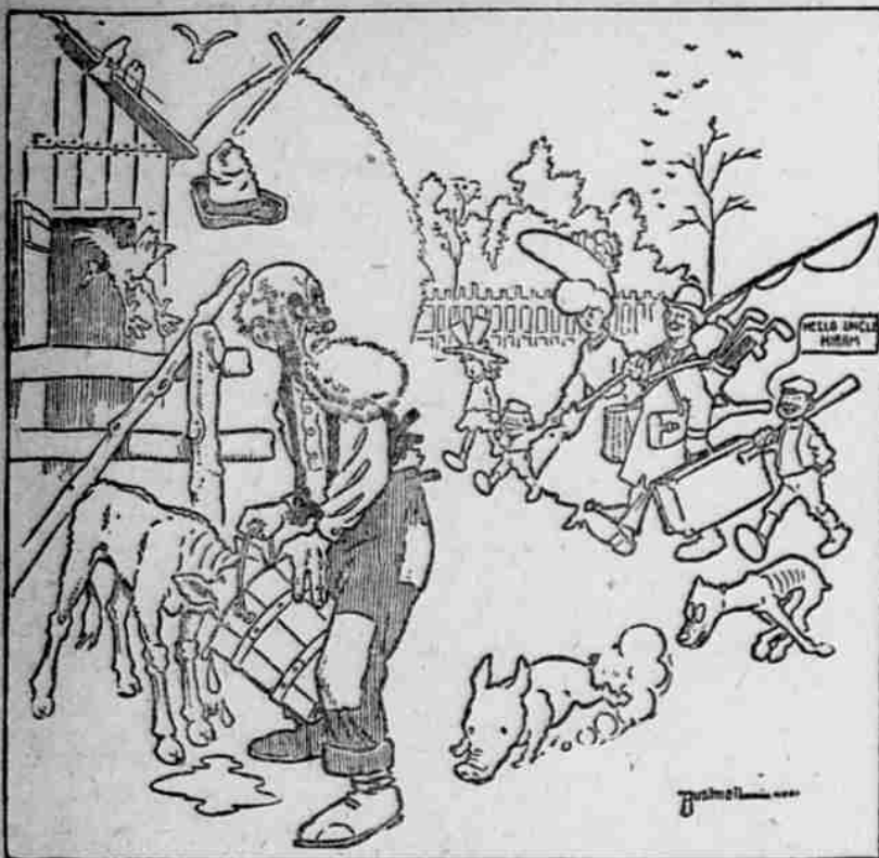
Farmer: "Sufferin' Job and the plagues of Egypt, here they come again!" —Milwaukee Journal.