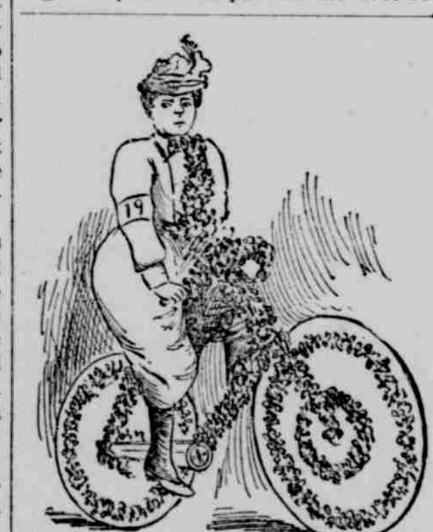
A PARISIAN RACER.

The original of the picture here produced is a danseuse from the Varieties and Opera House. Early last year she became a convert to the wheel, and during that year took part in the first fe-