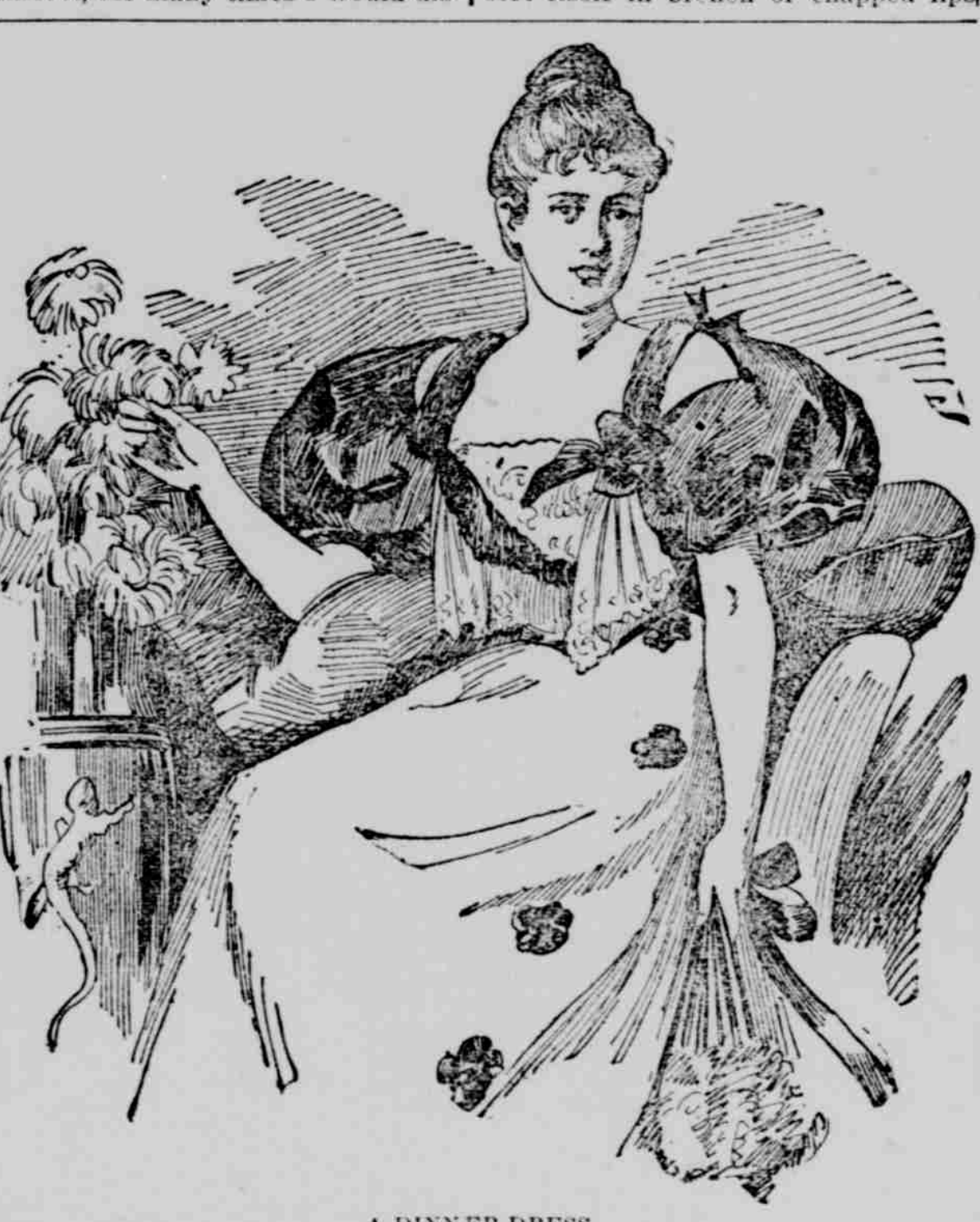
A DINNER DRESS.

Unlabeled lips come from an unhealthy stomach. Bad digestion will often assert itself in broken or chapped lips,