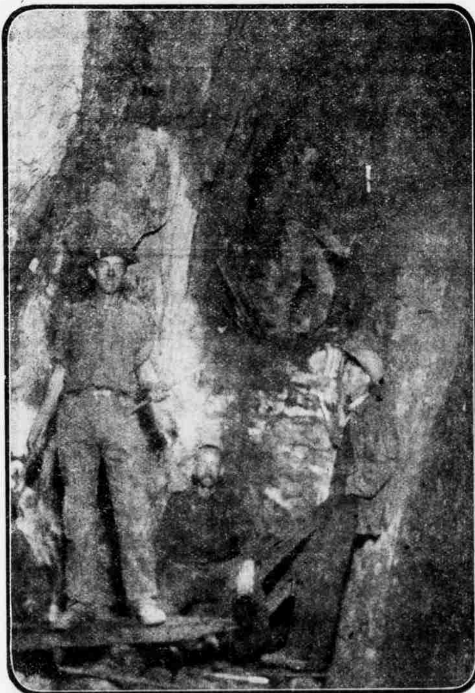
TUNNEL, HELLEN RAE MINE, NOGAL, NEW MEXICO.