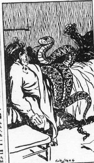
"Apparently Ready to Crush Out My Life."

The snake, which had been allowed to escape from its cage by careless attendants, had crawled about the