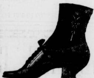
Ladies' Kid Oxford Shoes, with Patent Tips. $1.25.