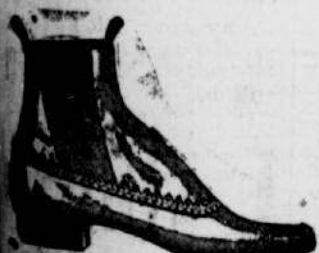
Men's French Calf Congress, Tip or Plain Toe. $3.00.

Write for Illustrated Catalogue, and Buy Shoes At St. Louis and New York Prices.