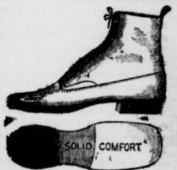
Men's Best Calf Lace Shoes, Solid Comfort Style. $2.50.

Seventy-Five Styles of Handsome Plush, Embroidered, Satin and Beaded Slippers at Prices Lower Than the Lowest.