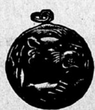
$10.00 No. 2881 Solid Gold Brooch Rose and Green Finish Ruby Doublets