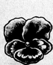
$10.00 No. 2865 Solid Gold Brooch Enameled in Colors Real Pearl Chateausse Attachment

DEPENDABLE JEWELRY —If all that glittered was gold, the buying of jewelry and precious stones would be an easy matter quickly accomplished, but there is so much that glitters that is not gold, so much that sparkles that deceives the eye, that it behooves the purchaser to buy only from established firms, where the word "Guarantee" means something.