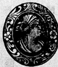
$14.00 No. 2878 14K Solid Gold Brooch Earl at Finish Hand Engraved Real Cameo