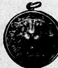
$15.00 No. 2859 Solid Gold Brooch Fine Sparkling Diamond and Ruby Eyes For Two Pictures