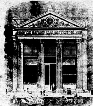
SAVINGS BANK BUILDING, MINOT, N. D.

5% Interest ON Savings Accounts Paid Jan. 1st and July 1st