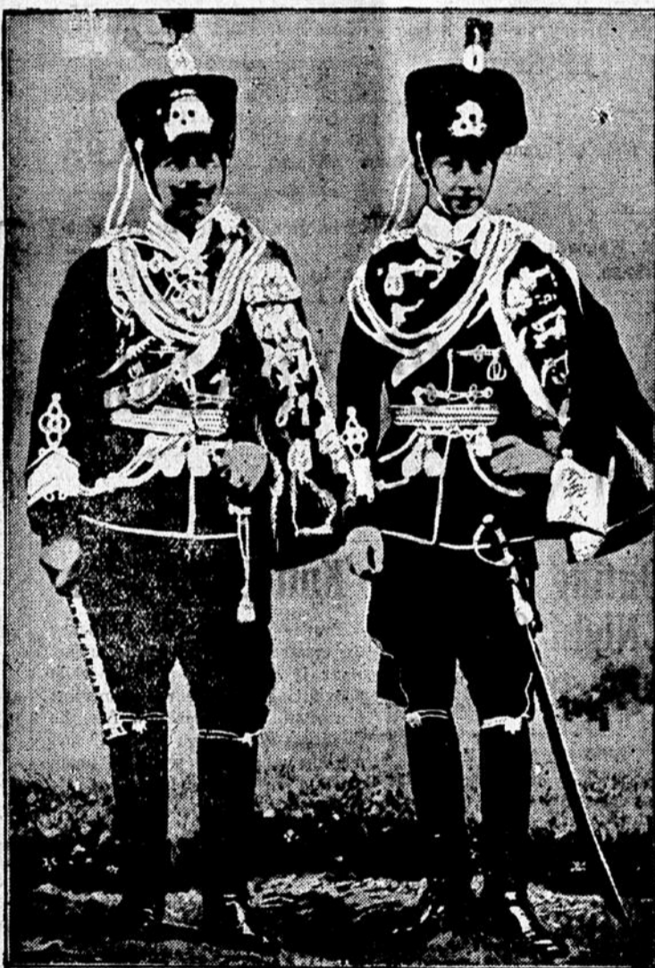
KAISER WILHELM THE CROWN PRINCE

This is a late and little seen picture of Kaiser Wilhelm and his eldest son, Crown Prince Frederick William. They are wearing the uniforms of the Hussars of the Guard, one of Germany's most famous regiments. What fate awaits the crown prince and his army in France? Will he be cut off from the other German armies and surrounded, or will he maintain his po- sition successfully, or will he retreat to a base of supplies nearer Germany? And the Kaiser—what will fate eventually deal out to him?