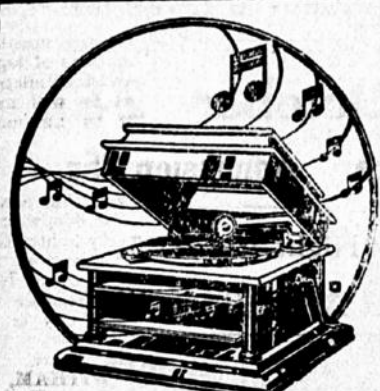
The JEWEL PRICE $35.00