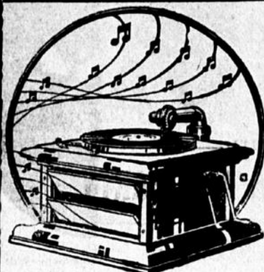
The ELLIPE PRICE $25.00