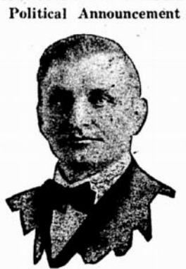
ALFRED MOSTAD Candidate for Re-election County Treasurer Ward County. I respectfully solicit your vote and support.