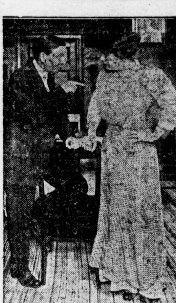
Scene in "Bought and Paid For," Tacoma, Friday and Saturday.