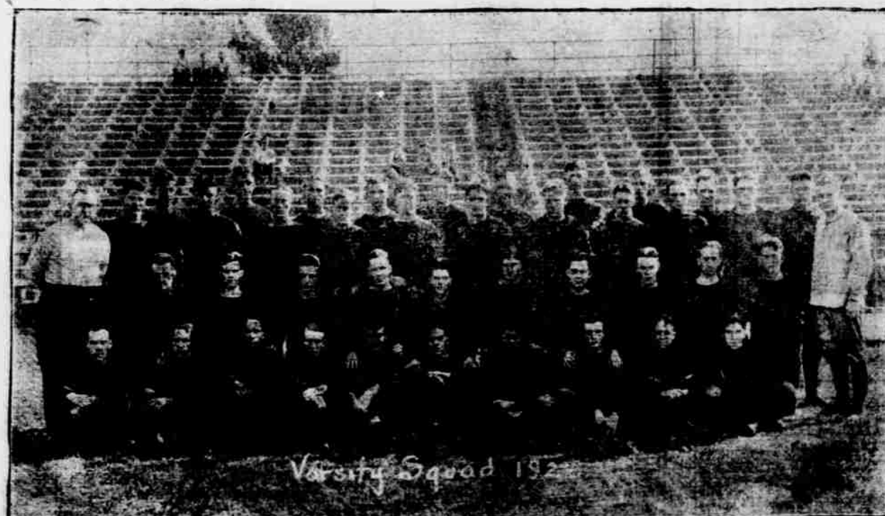
The 1922 Missouri Varsity Football Squad. As one looks 'em over he can't suppress that little sentiment—"Eat 'em up Tigers."