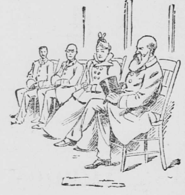
WAITING TO SEE THE MAYOR. the walls on each side of the big en-

"If anything goes wrong every man, woman and child feels it his or her duty to jump on me. Then,