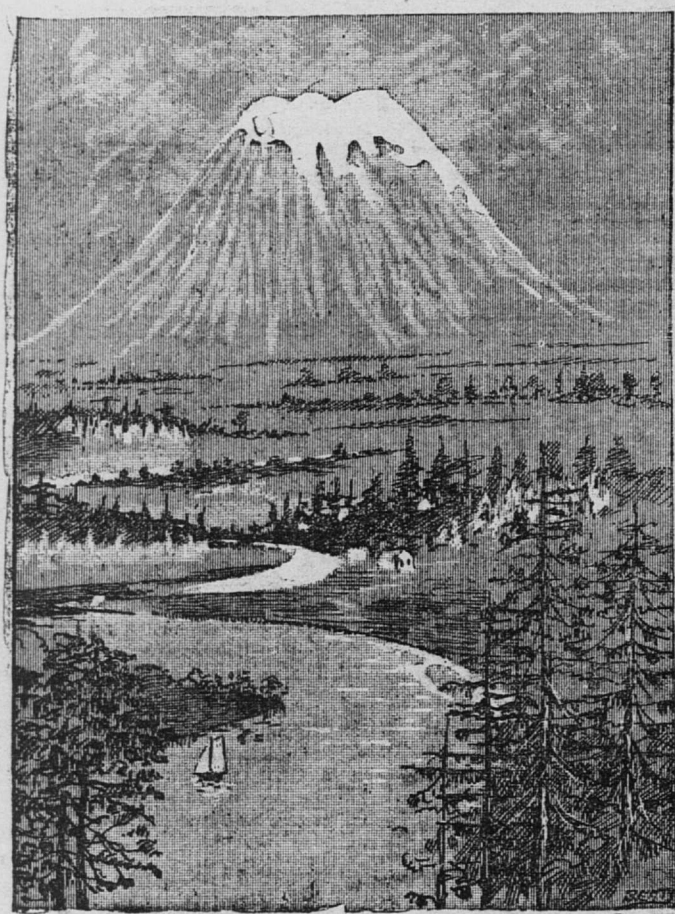
DISTANT VIEW OF MOUNT RAINIER.

THE GLOBE Will Give the three persons from whom it receives between July 1 and Aug. 1, 1895, the three largest amounts of money for new subscriptions to the Daily, Sunday or Weekly Globe: