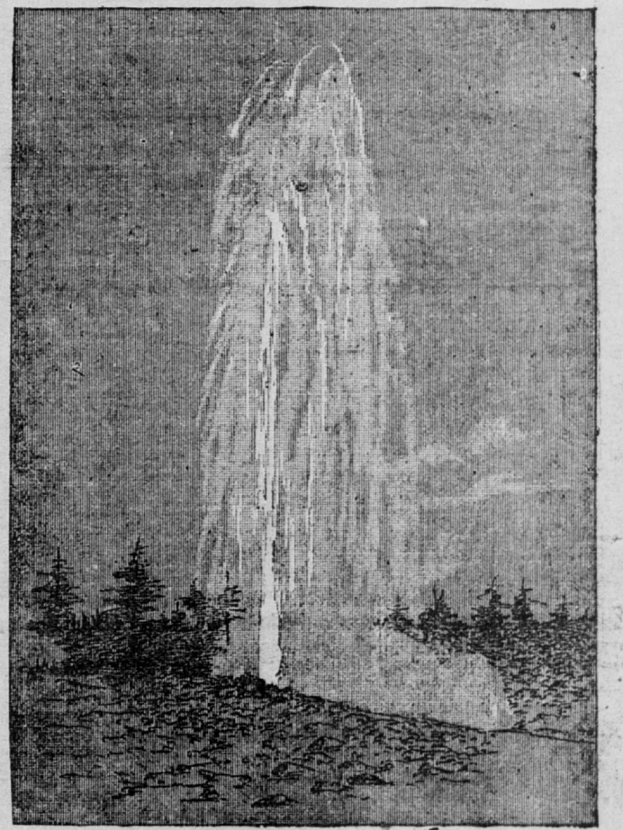
OLD FAITHFUL GEYSER, YELLOWSTONE PARK.

2d A Free Trip from St. Paul to Yellowstone Park and Return over the Picturesque Northern Pacific Railroad. This ticket includes transportation, double Pullman berth and meals in dining cars both ways. Also five and one-half days' staging in the Park and five and one-half days' meals and lodging in the hotels of the Yellowstone Park Association. This ticket good from Aug. 1 to Oct. 31, 1895, and from any intermediate station, and stop off at any station on the Northern Pacific Railroad. . . . .