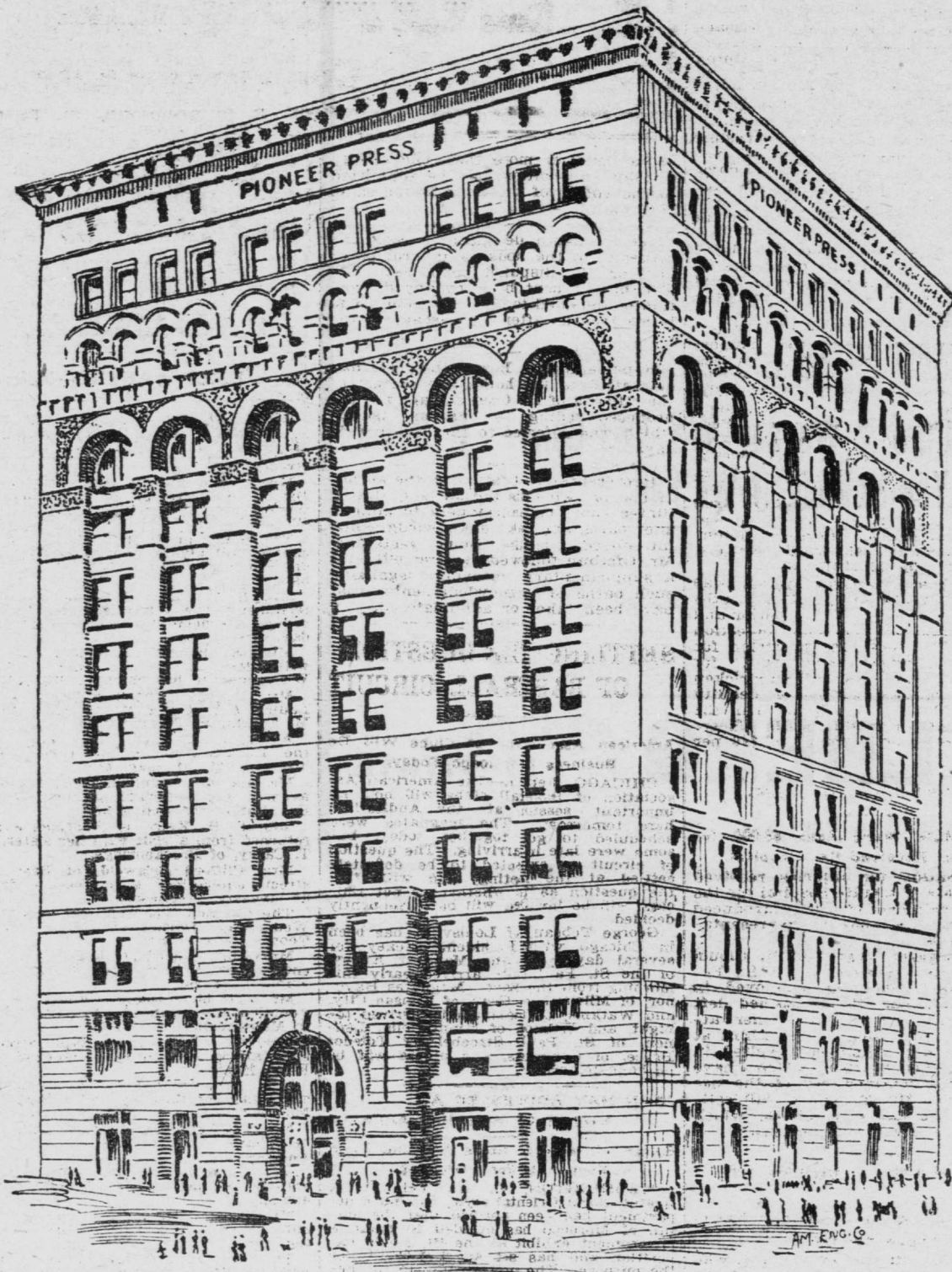
PIONEER PRESS BUILDING, CORNER FOURTH AND ROBERT STREETS.