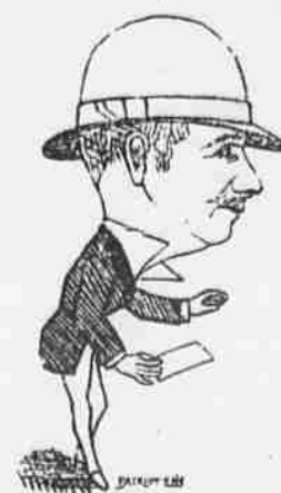
The junior member

With a nice new line of the best groceries on the market. Keep your eye on our window for all the fruits and vegetables in season.