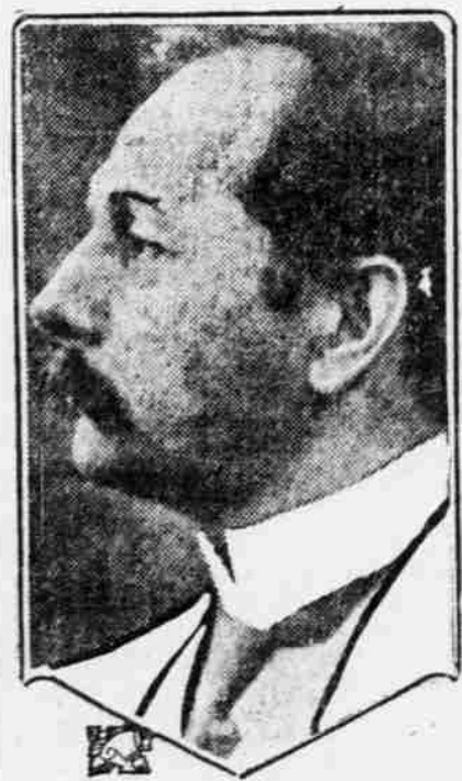
John K. Shields.