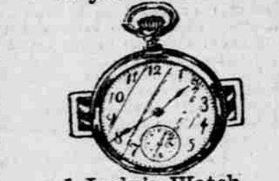
1 Lady's Watch 1 Gent's Watch