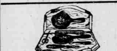
1 Fine Toilet Set in Case