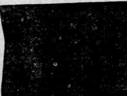
2 Beautiful 10 yr. Warranted