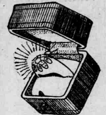
Fine Chest Rogers' Silverware