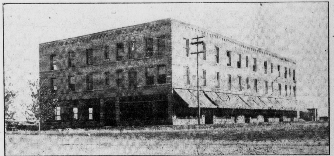
HOTEL OREGON, EL CENTRO